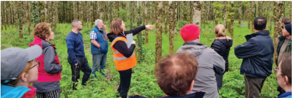
Forest events are a great opportunity to see tree planting in action, meet with forest owners and understand different forest types and management based on specific objectives.