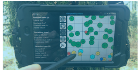
Marteloscope workshops encourage learning by doing.

and the other many important services that forests can provide to owners and society.