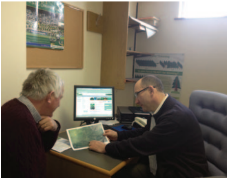
Teagasc provides extensive supports for people considering tree planting and new forest creation.

The current Forestry Programme remains open for applications and when details are finalised it is envisaged that applications in the system will be able to be transferred to the new Forestry Programme if applicants wish to do so.