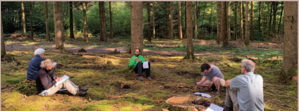
The objective of the project is to improve the level of information, knowledge and skills of forest managers and owners in the field of CCF.