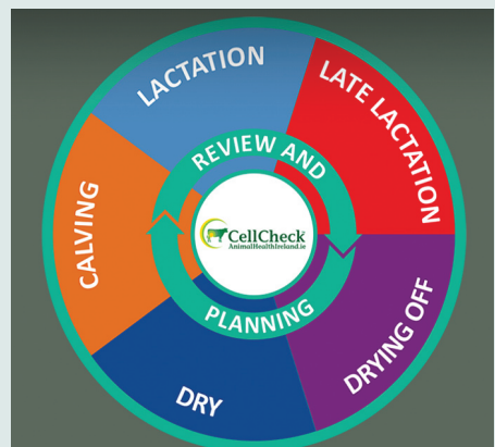
FIGURE 1: CellCheck Farm Guidelines for Mastitis Control cover the entire lactation cycle.

https://animalhealthireland.ie/programmes/cellcheck/farm-guidelines/ .