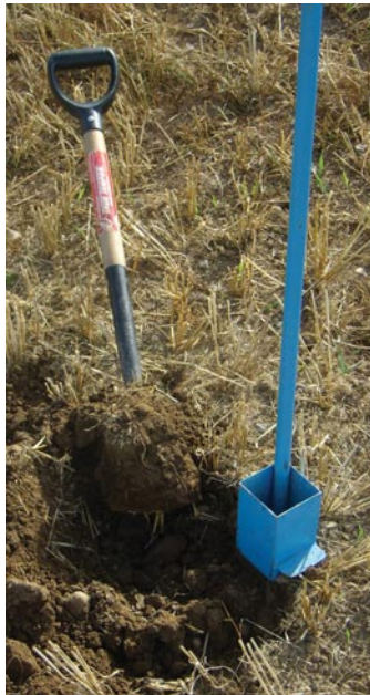
Now is the best time to take soil samples.

Now is the best time to take soil samples and plan lime/fertiliser/manure programmes for 2015. For grassland soils, request an S1 test to check the soil's lime status, and phosphorus