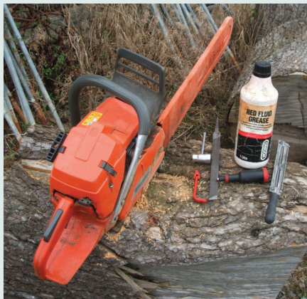
Chainsawing can be lethal.

Following the February storm, there is a lot of wind-blown timber on farms. Cutting-up and removing this timber is potentially dangerous and needs to be risk assessed. The key decision is to assess what timber cutting you can do yourself and what is left to the professional. Cutting down trees generally, or hung-up or blow-over trees, which are hinged at the root, is particularly dangerous. Timber under tension is also dangerous, as it can split and strike a person. Chainsaws need to have a full range of safety features including a safety chain, chain brake, chain catcher, and be correctly sharpened. Wearing chainsaw protective equipment is vital, this includes: clothing and gloves with ballistic nylon; helmet with visor and ear defenders; and, suitable footwear.